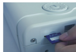
Optional SD card for massive data storage